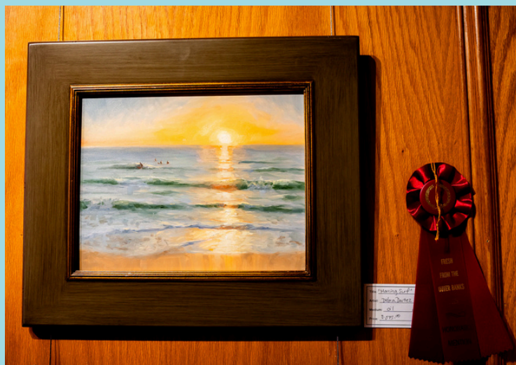
2025 Honorable Mention "Morning Surf" by Debra Dartez.