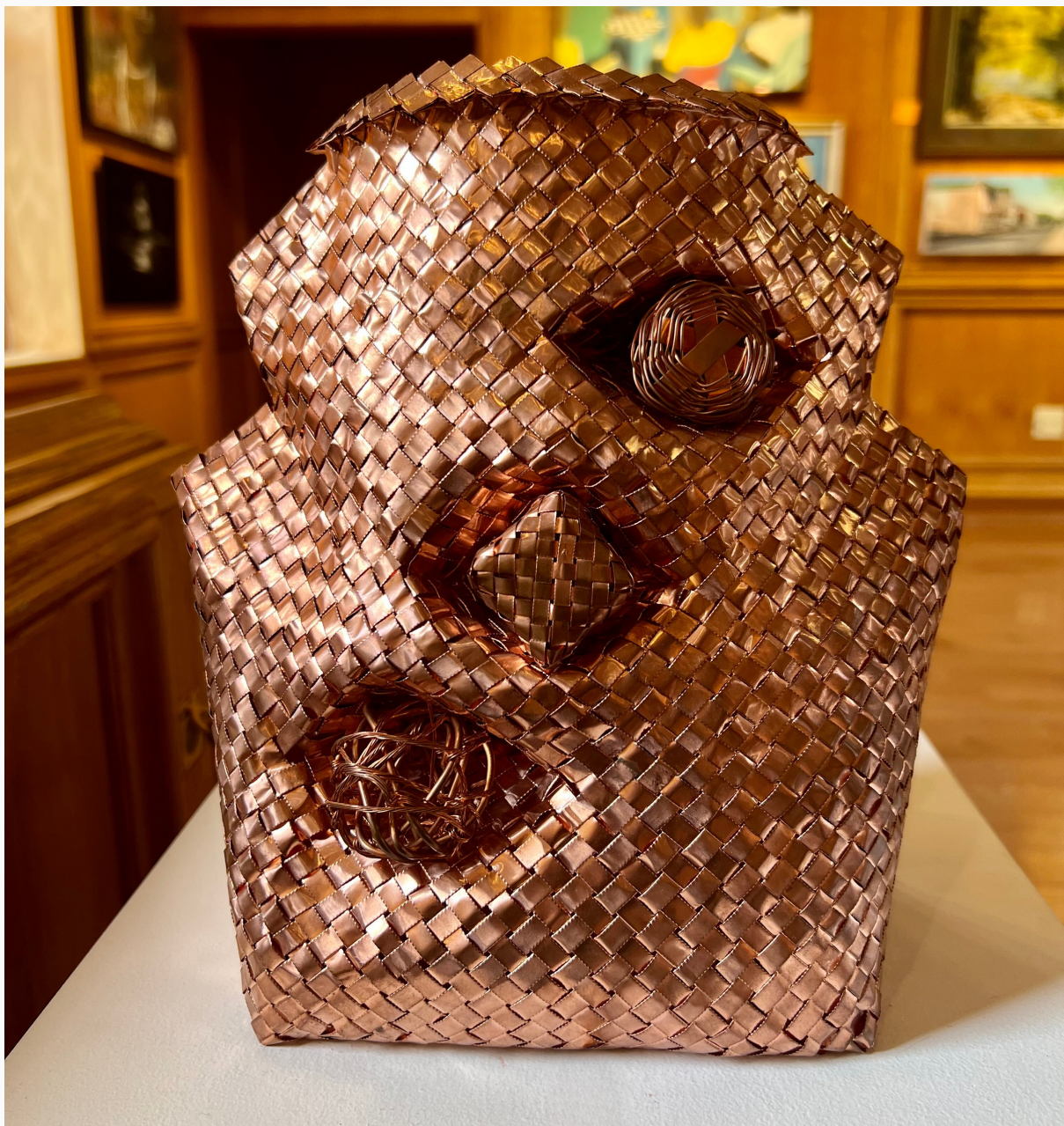
2023 Best in Show - Judith Saunders' Woven Copper "Nooks & Crannies"